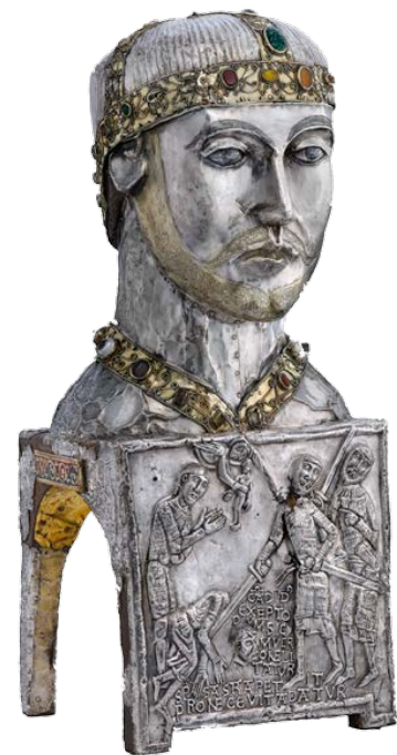
Reliquary bust of Saint Candidus, about 1165. Treasure of the Abbey of Saint-Maurice.