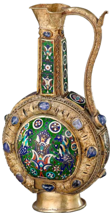
Ewer known as “Charlesmagne’s ewer”, mid-9th century. Treasure of the Abbey of Saint-Maurice.