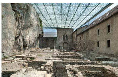
The archeological site of Martolet: there have been 8 churches here since the 4th century.