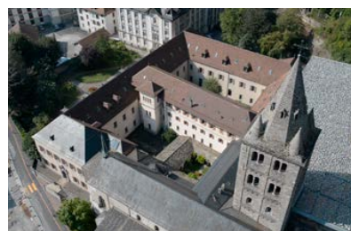
Aerial photograph of the Abbey of Saint-Maurice.