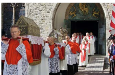
The mass marking the feast of Saint Mauritius follows the procession bearing the relic of Saint Mauritius.

Swiss Post will be present at the monastic market in Saint-Maurice with a special post office on 22 September 2015. Further information will be published in Focus on stamps 2/15 and at www.swisspost.ch/stamps > Agenda